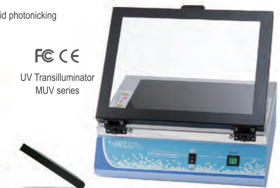
UV Transilluminator MUV series