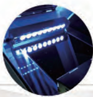
SmartView Transilluminator MUVB-100 series

*High performance UV light model also available.