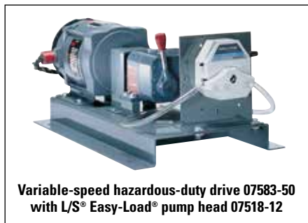
Variable-speed hazardous-duty drive 07583-50 with I/P Easy-Load® pump head 77601-00